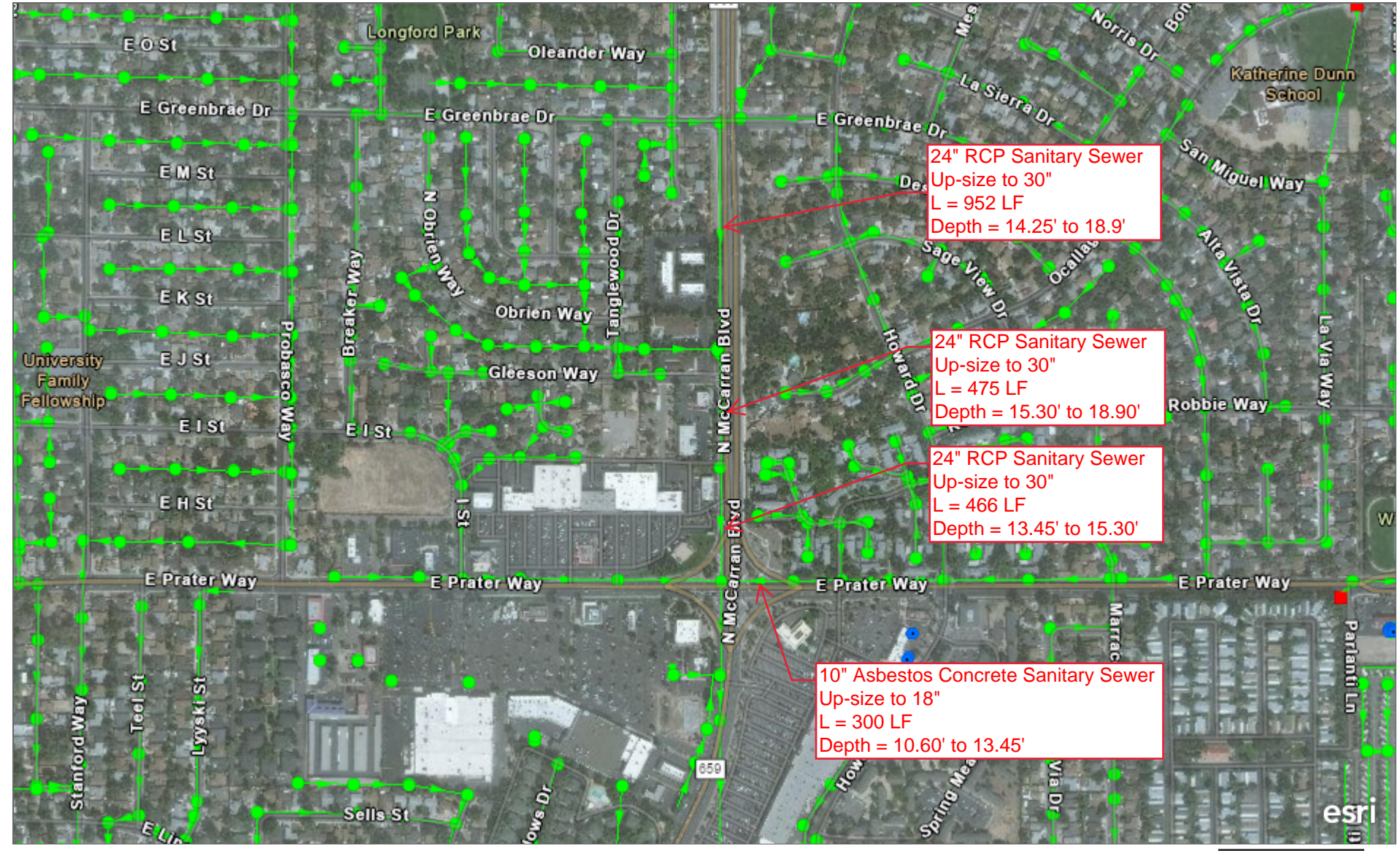
Utilities, City of Sparks